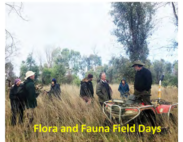
Flora and Fauna Field Days