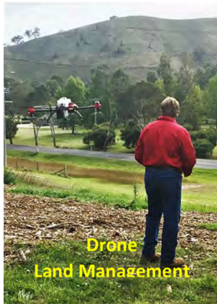
Drone Land Management