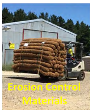
Erosion Control Materials