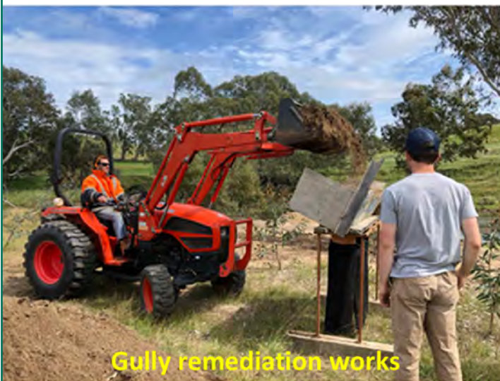
Gully remediation works