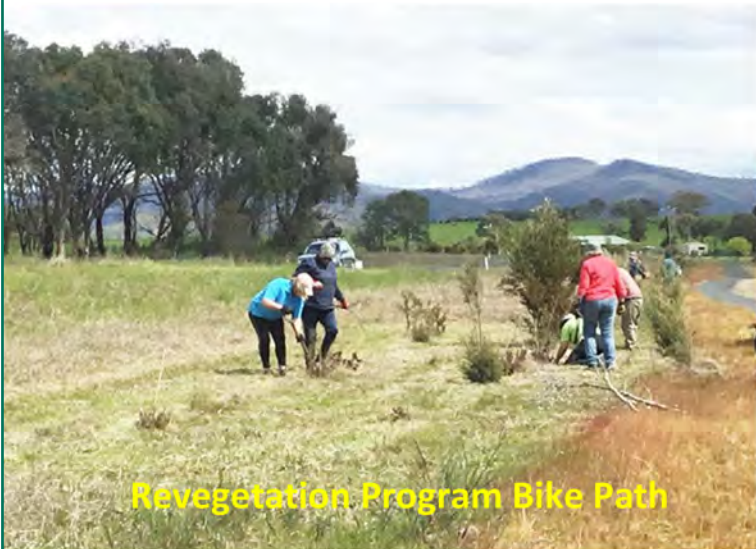
Revegetation Program Bike Path