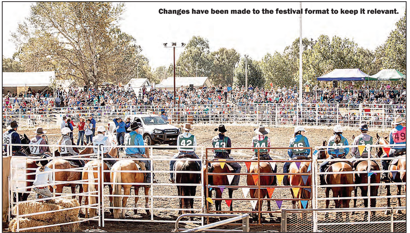
Changes have been made to the festival format to keep it relevant.

to RM Williams, our naming rights sponsor. It is exciting to see them go from strength to strength back in Australian ownership and we are genuinely excited with what the future holds collectively for both of our organisations.