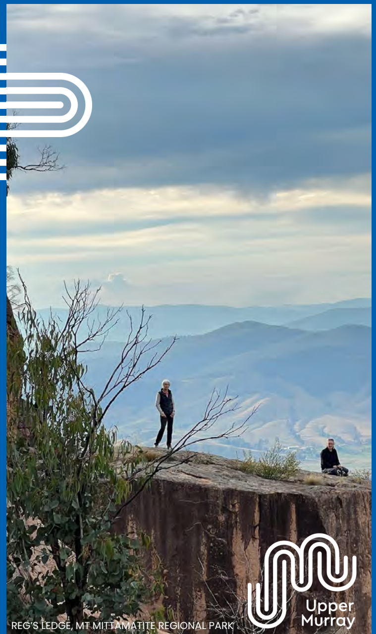
REG'S LEDGE, MT MITTAMATITE REGIONAL PARK