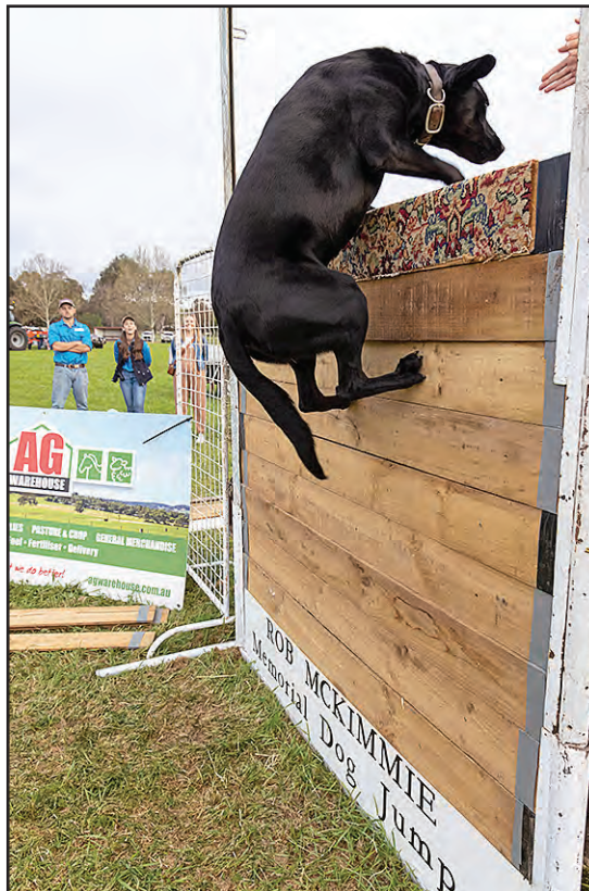
The dog jump attracted a large and supportive audience.