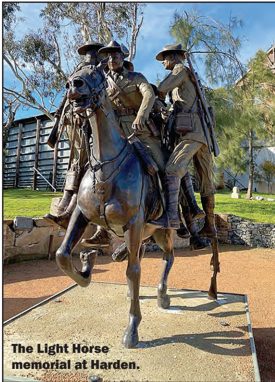
The Light Horse memorial at Harden.