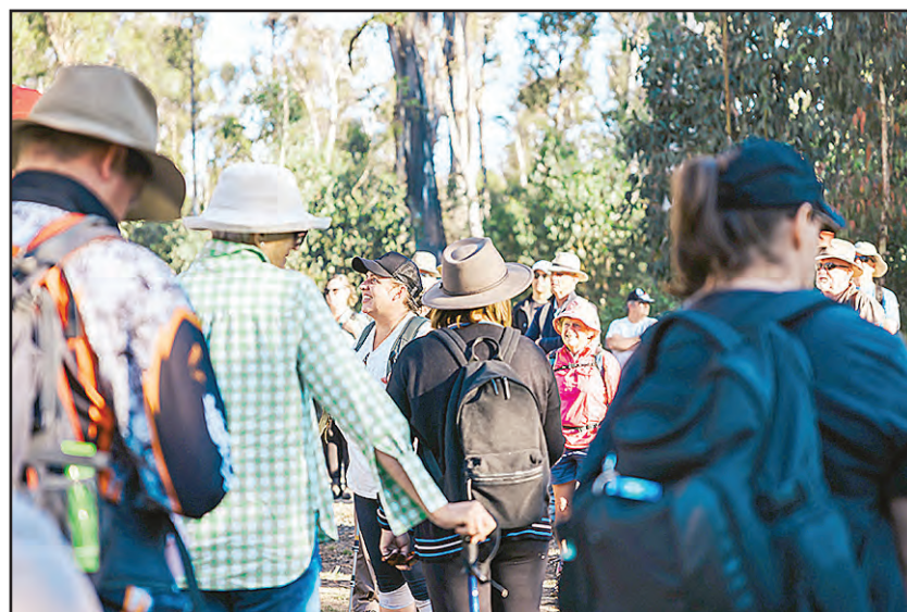
Tumbatrek was a beneficiary of a community grant last year.

Earlier this year, the first round saw more than