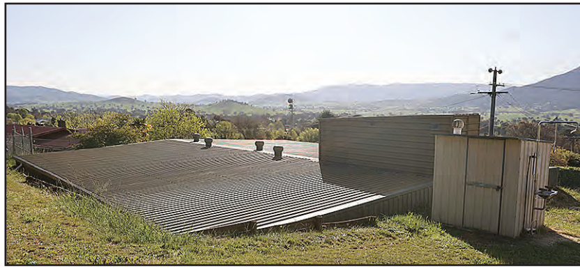
The Corryong reservoir in Greenham Street today.

By late September 1924 the scheme was near completion with the source of supply made functional and six inch (15.2cm) diameter pipes being laid to the main concrete service basin about three kilometres from town. This was supplied from an off-take on Nariel Creek at the Public Reserve now known as the Colac Colac Camping Ground