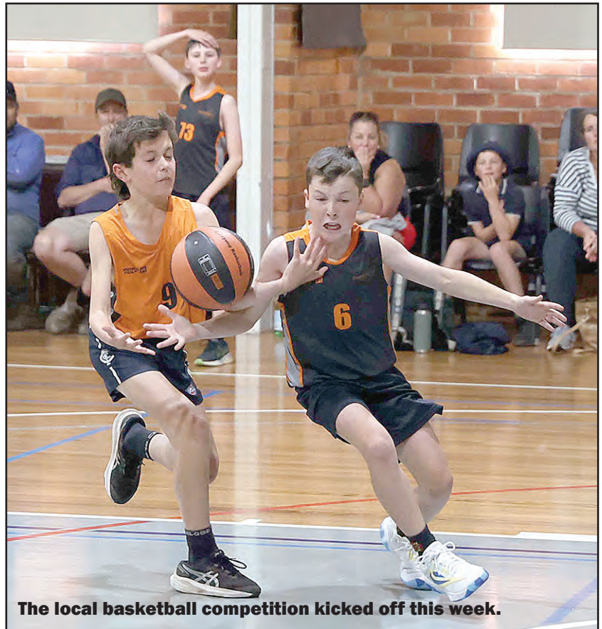
The local basketball competition kicked off this week.

Results R1 Tuesday 8/10/24 Junior Mixed 2A Spurs 20 d Celtics 17 Lakers 39 d Rockets 20 Junior Mixed 2B Heat 21 d Bulls 15 Magic 19 d Kings 10 Wednesday 9/10/24 Open Women Fillies 31 d Fossils 16 MAD 31 d Rebels 16 Mavericks 19 d Demons 8 Draw R2 Tuesday 15/10/24 Junior Mixed 2A 5.20pm: Warriors v Rocks 6.10pm: Celtics v Lakers Junior Mixed 2B 3.40pm: Heat v Kings 4.30pm: Bulls v Magic Open Women 7.00pm: MAD v Fossils 7.50pm: Fillies v Mavericks 8.40pm: Demons v Rebels Wednesday 16/10/24 Junior Mixed Div 4 3.40pm: Hornets v Nets 4.30pm: Bucks v Raptors Junior Mixed Div 3 5.20pm: Suns v Thunder 6.10pm: Knicks v Timberwolves Open Men 7.00pm: Purple Cobras v Rip City 7.50pm: Mustangs v Brick-layers 8.40pm: Raptors v Bulls