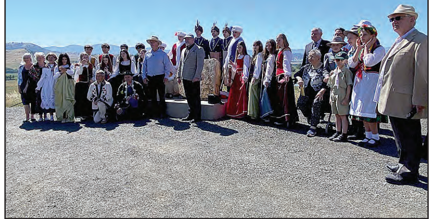
Visitors in traditional Polish dress at the Strzelecki memorial

What the wedge-tailed-eagle riding on the thermals above thought of the violins and the colourful Polish national costumes, we will never