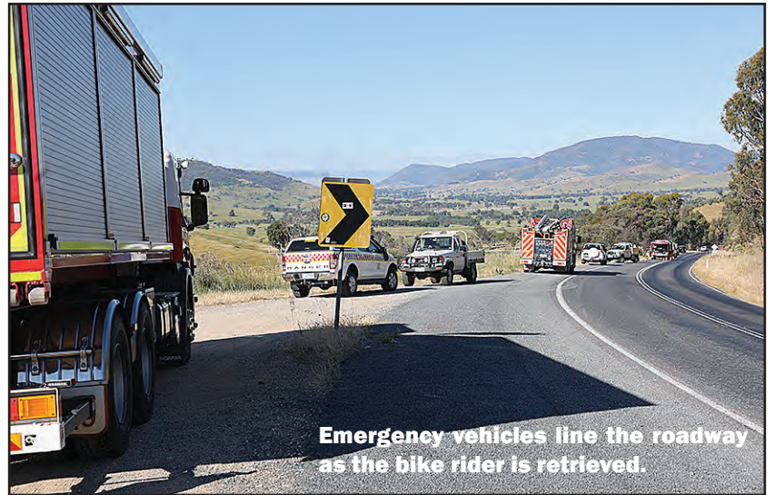
Emergency vehicles line the roadway as the bike rider is retrieved.

In related news, forensic police are investigating a fatal crash after two young men were located deceased in the Benambra area on Saturday afternoon.