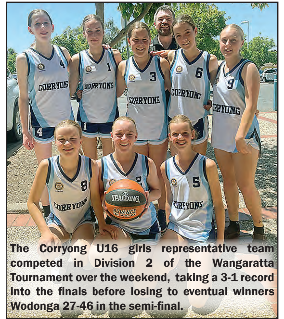
The Corryong U16 girls representative team competed in Division 2 of the Wangaratta Tournament over the weekend, taking a 3-1 record into the finals before losing to eventual winners Wodonga 27-46 in the semi-final.