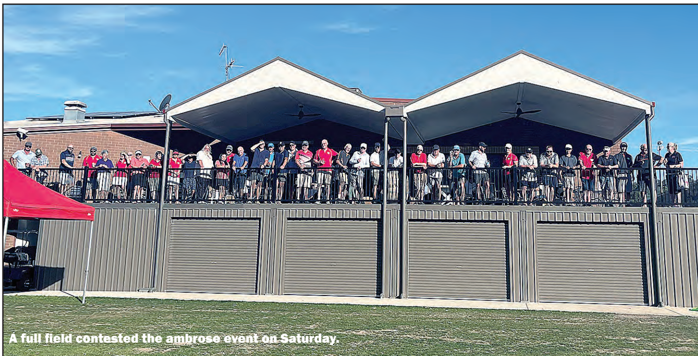
A full field contested the ambrose event on Saturday.