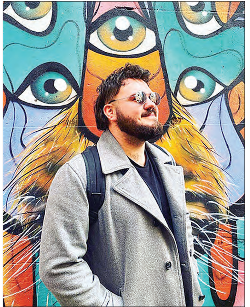
Art show born from local connection