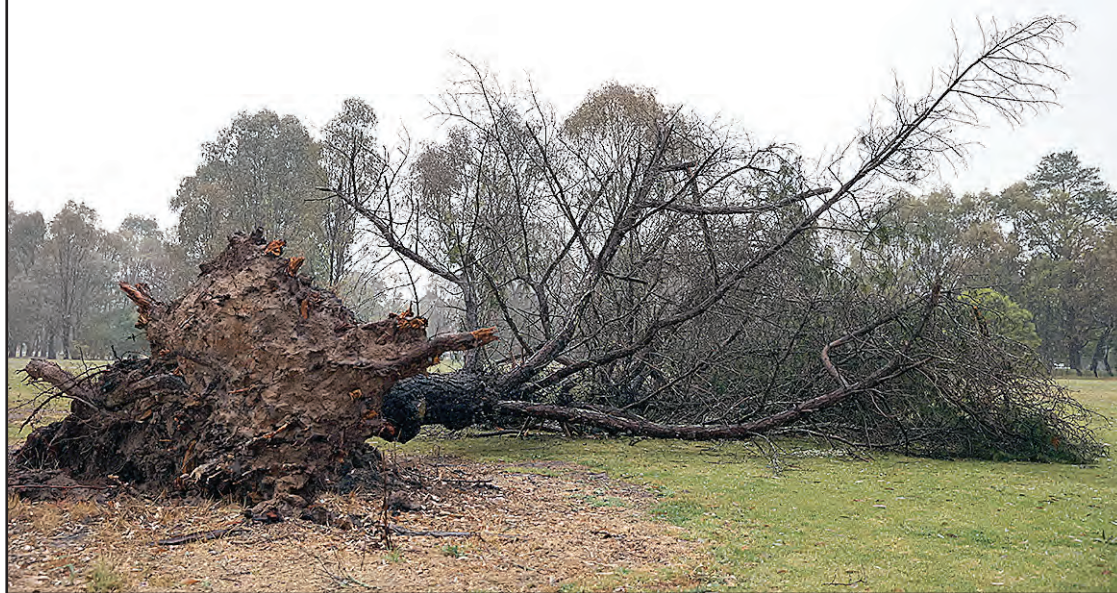
This tree came down on the 3rd fairway on Sunday morning - shortly after a foolhardy trio of frustrated pennant golfers had played the hole!