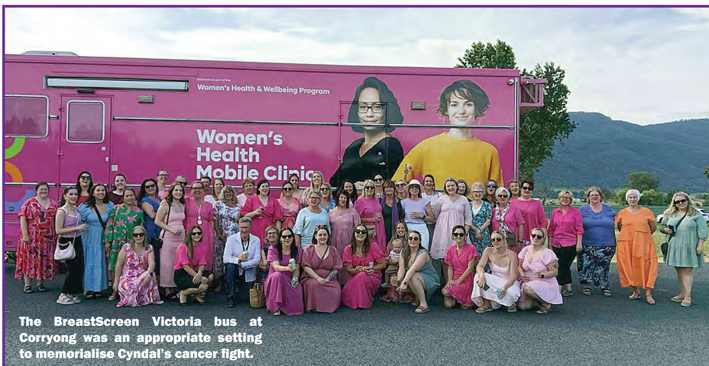
The BreastScreen Victoria bus at Corryong was an appropriate setting to memorialise Cyndal's cancer fight.