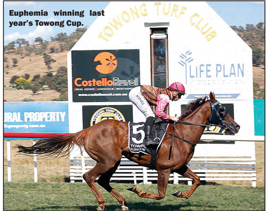
With fine weather forecast over the next few days, the track is expected to be rated as a Good 4. General admission tickets are available online for $25 at towong.tickets.countryracing.com.au/ or at the gate ($30 cash only).

The seven-event program has an earlier than usual start with the first race starting at 12.59pm and the final event at 4.40pm. Final acceptors will be declared later today.