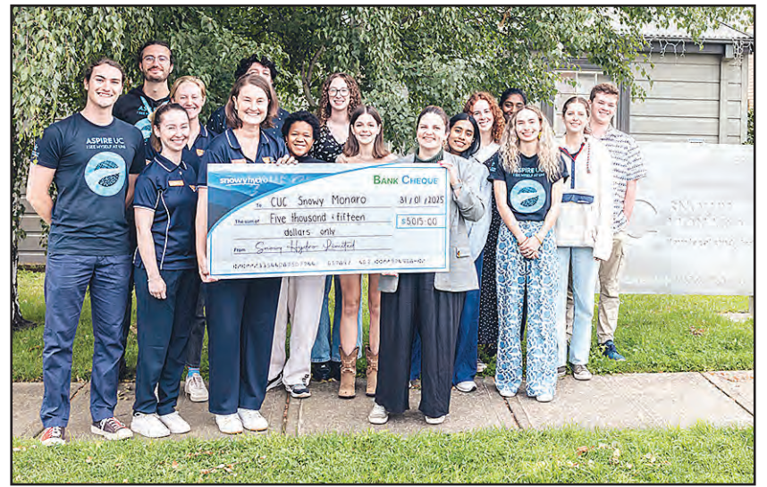
CUC Snowy Monaro received $5015 towards a future leaders program.

Past recipients include CUC Snowy Monaro, which used its grant to deliver the 'Speak Up' program, helping young people develop leadership and; Big Brothers Big Sisters in Tumut, which expanded its mentoring