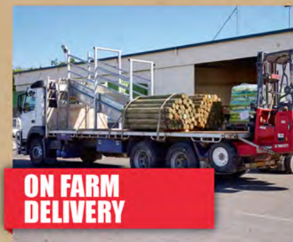
ON FARM DELIVERY