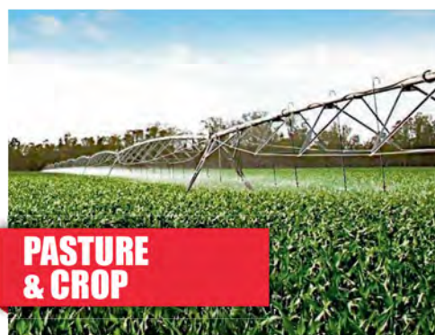
PASTURE & CROP