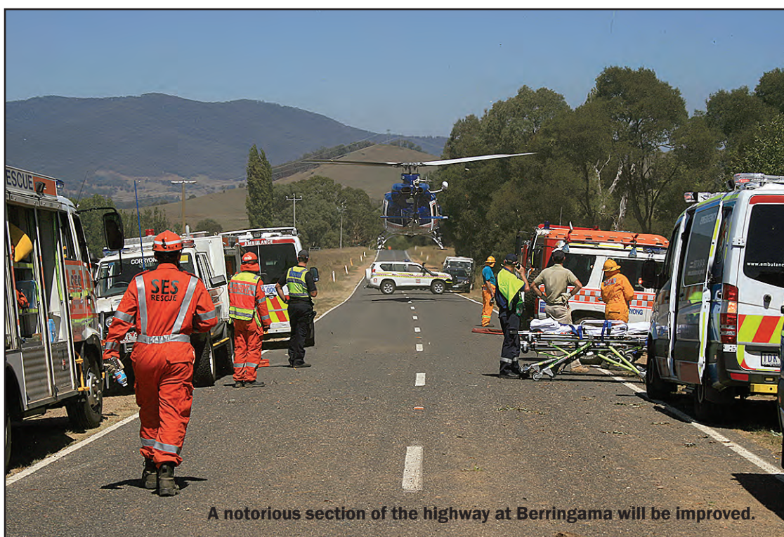
A notorious section of the highway at Berringtona will be improved.

"The Murray Valley Highway is a crucial freight route and an