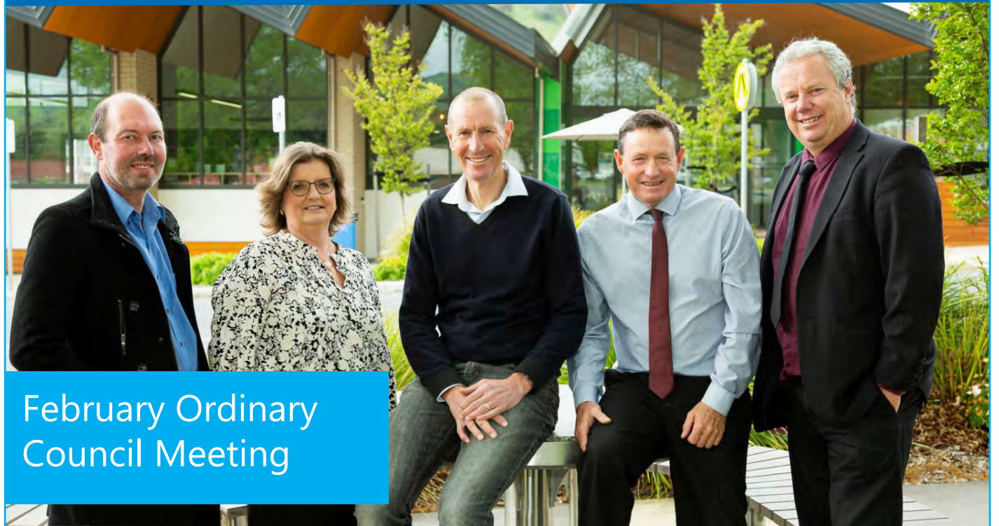
February Ordinary Council Meeting