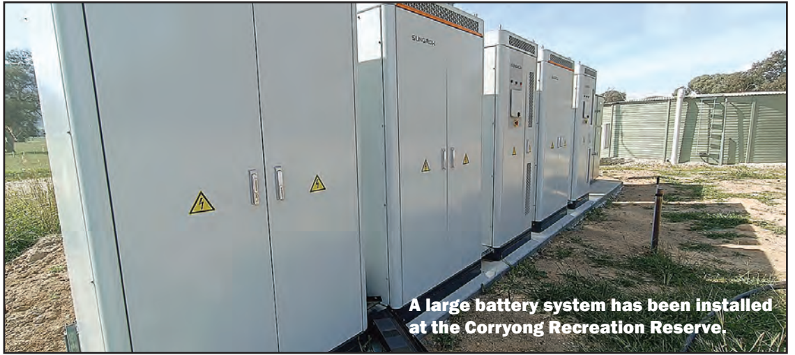
A large battery system has been installed at the Corryong Recreation Reserve.

The loss of power in the Upper Murray region during and after the 2019/2020 bushfires placed an additional strain on communities and emergency services but the shortfall has now been addressed by boosting systems on critical sites. Under the Upper Murray Place Based Power Plan - Energy Resilience and Reliability Project, a combination of solar, battery and generator systems have been supplied and installed across 23 sites in the region.