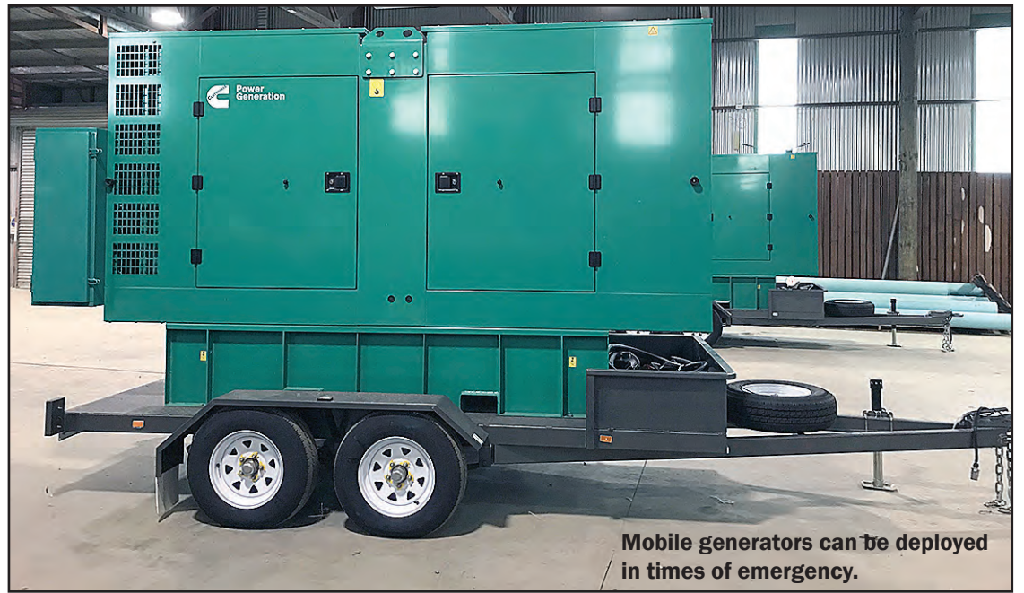
Mobile generators can be deployed in times of emergency.

Funding for this project was provided from the Victorian government's Repair and Replacement of Essential Water Infrastructure Program as well as $300,000 from North East Water's capital expenditure program.