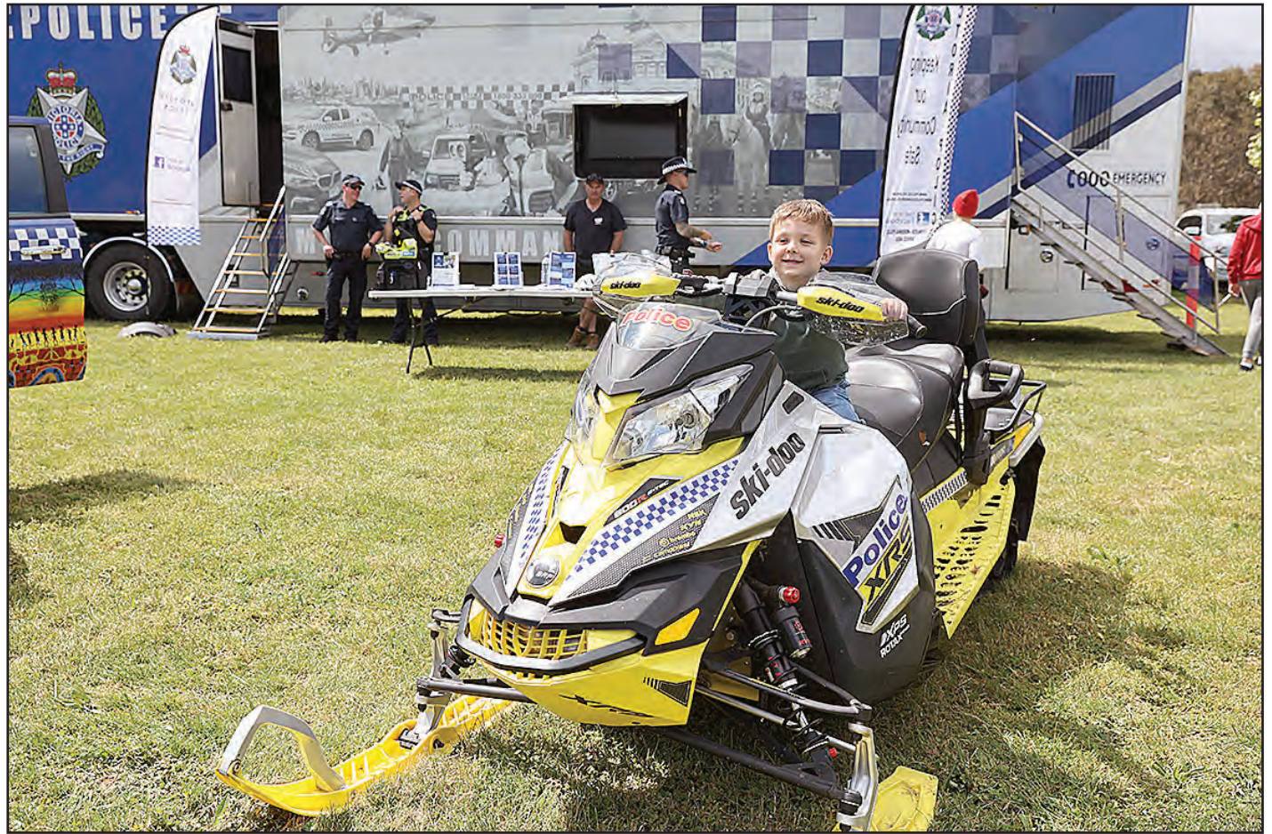
The Corryong Emergency Services Expo was the catalyst for the school safety workshops.

person, tailored safety advice to your farm. The team will be busy conducting on-farm safety visits, safety briefings as well as attending field days and presenting to community groups." Visit www.makingourfarmssafer.org.au/ to learn more and access the resources on offer.