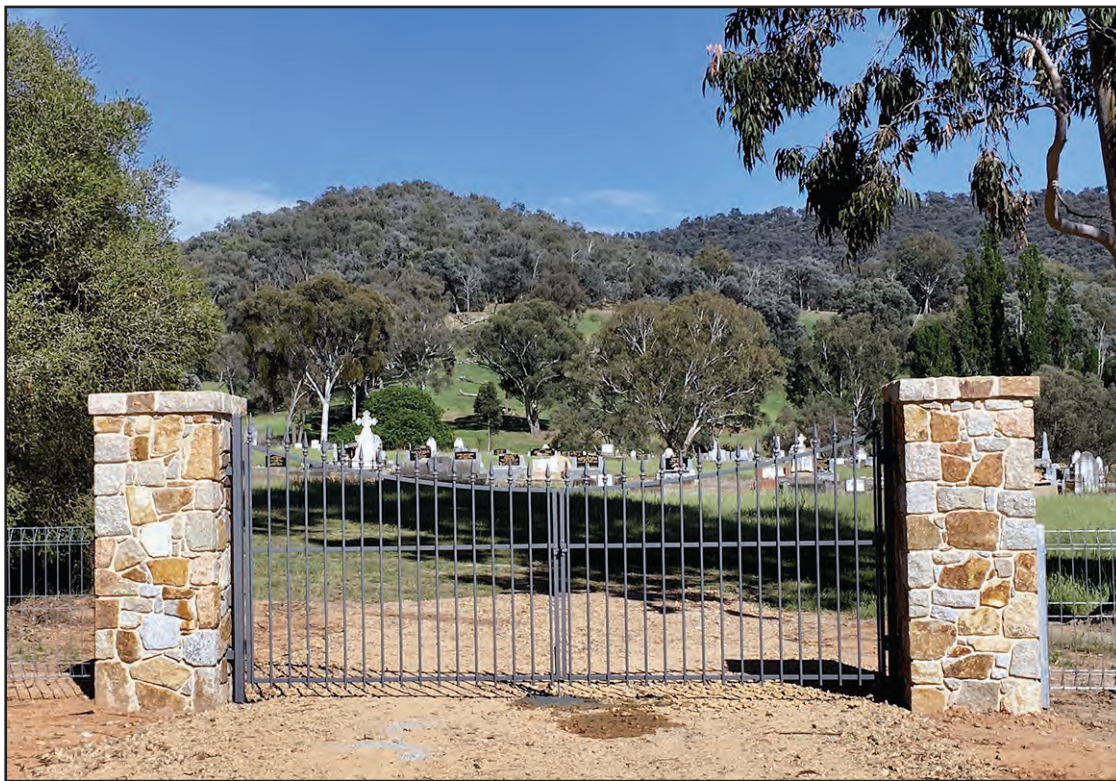
Information is wanted about a number of graves in the Walwa cemetery.

"We are appealing to the community to assist