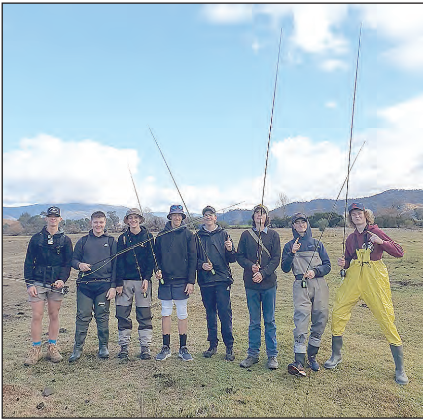
Students get ready to test out their newly learnt skills.

We started at the Swampy Plains River, by the Khancoban airfield and although the fishing was tough as the season was coming to an end, the boys showed great determination and put their newly found skills into practice.