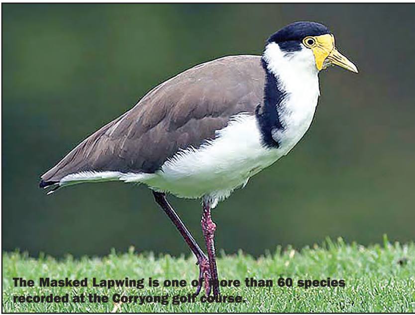
The Masked Lapwing is one of more than 60 species recorded at the Corryong golf course.