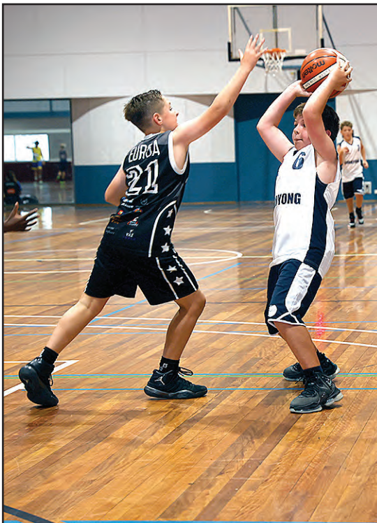
The new group's vision is to develop aspiring young athletes in our community across a number sports.

Applications close at 12pm on February 2, 2025.