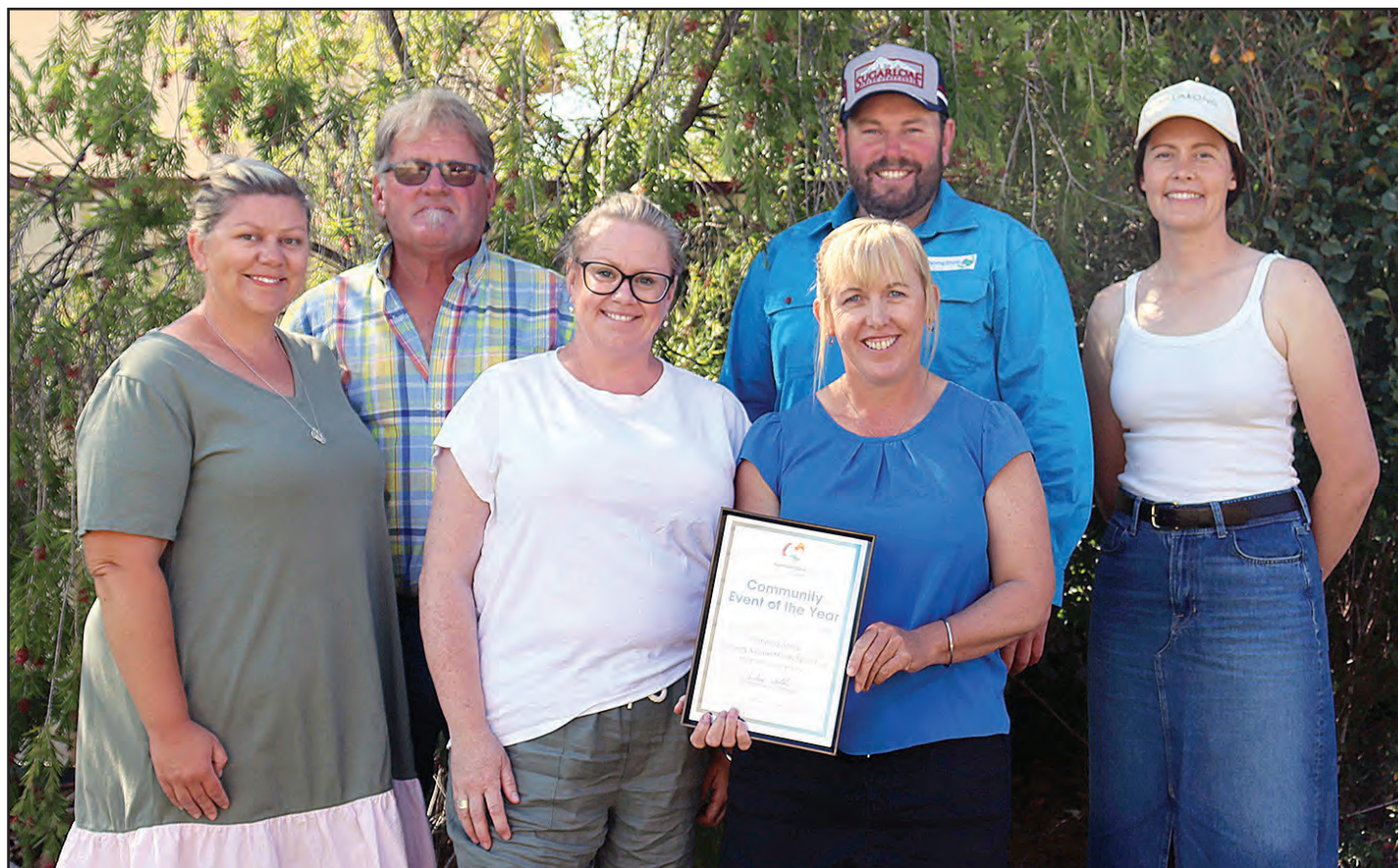
Committee members of the Corryong Show with their 'Event of the Year' award.