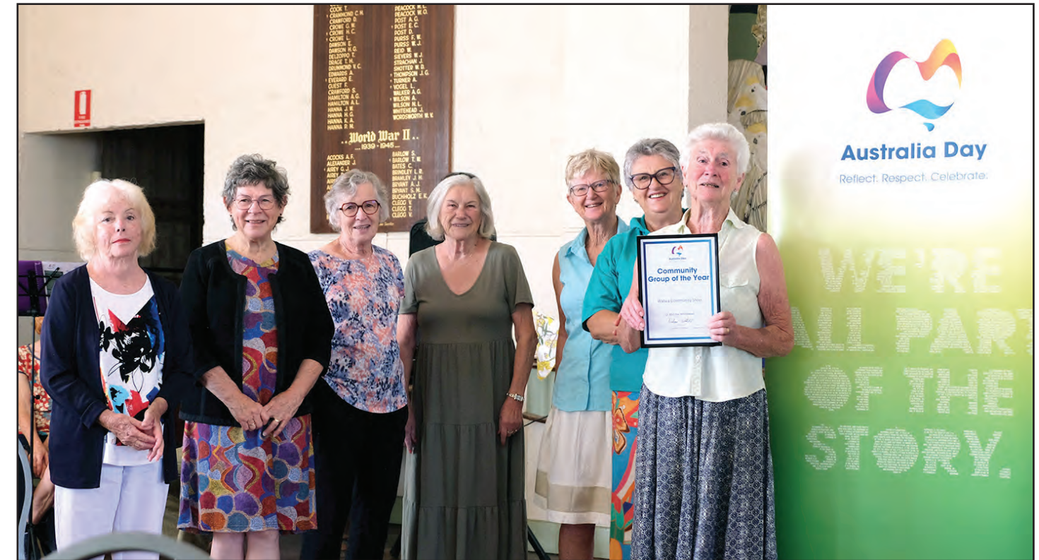
Members of the Walwa Community Op Shop with their 'Community Organisation of the Year' award.