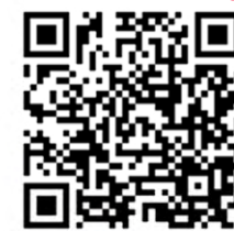
Scan QR code for my speech

More beds means more ambulances on the road and more surgery