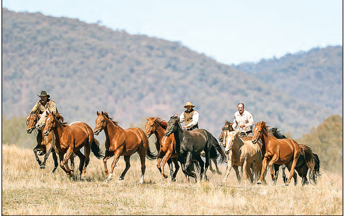
Riley's famous ride is reenacted at the bush festival each year.