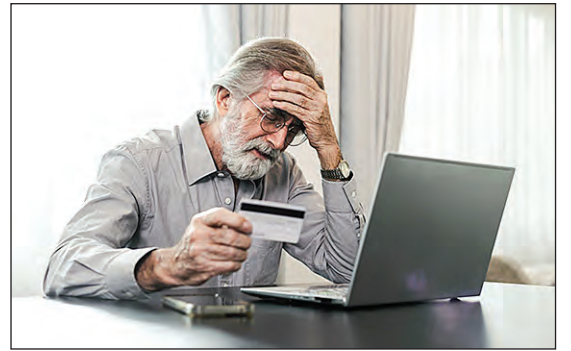
New tools help protect against scams.

"Their long-standing reputation makes them a strong