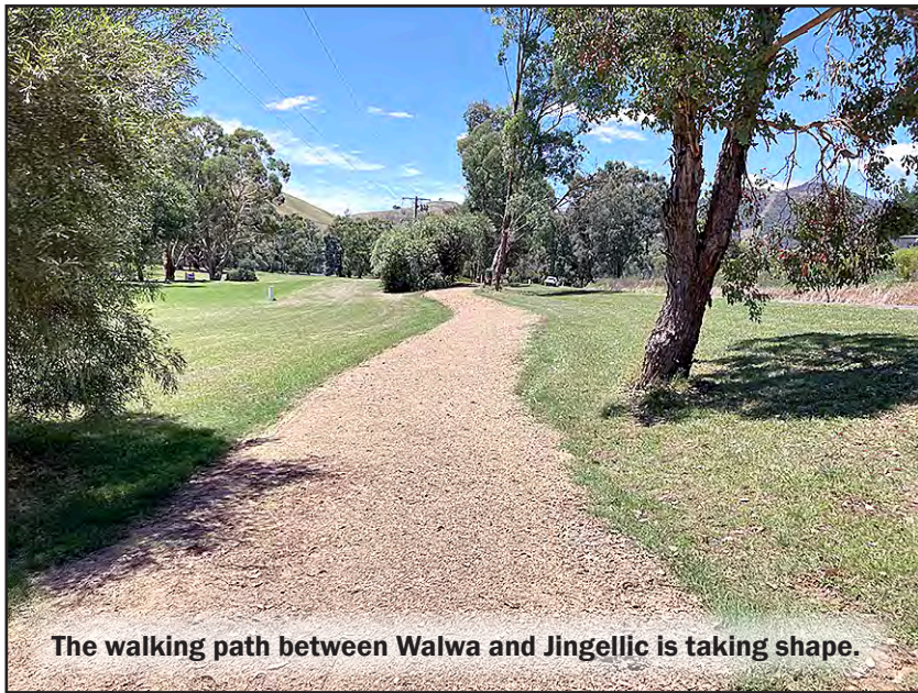
The walking path between Walwa and Jingellic is taking shape.