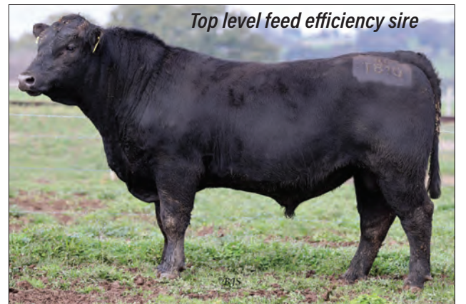
Top level feed efficiency sire

LOT 17 REILAND TALLANGATTA T810 NLR22T810