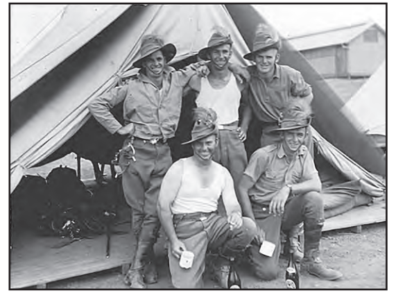
Members of the 8th Light Horse Indi troop in camp.

There will be an Australian tent pegging judge in attendance to give tuition in the sport and skill at arms and a retired master farrier to answer all your questions about hoof care and other topics. A director of the Australian Light Horse Association will also be in attendance