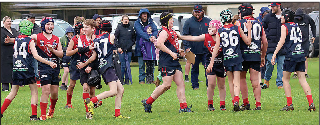
Demons' players were jubilant after downing Bullioh in the U12 preliminary final.