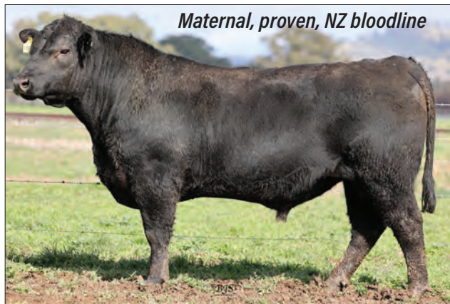
Maternal, proven, NZ bloodline