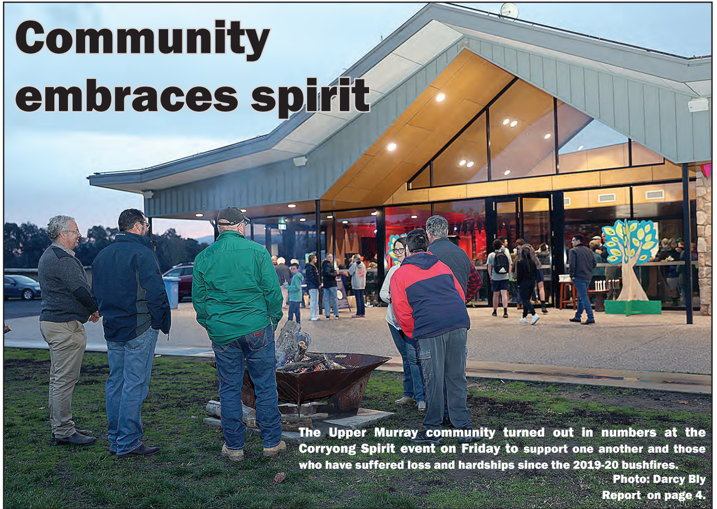
The Upper Murray community turned out in numbers at the Corryong Spirit event on Friday to support one another and those who have suffered loss and hardships since the 2019-20 bushfires.