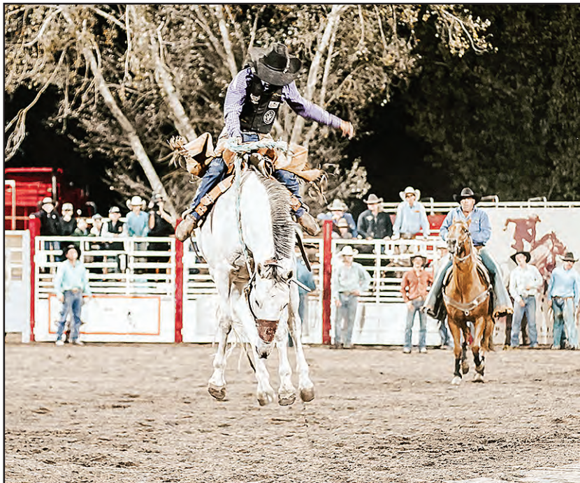
Action from the Saturday night rodeo spectacular.