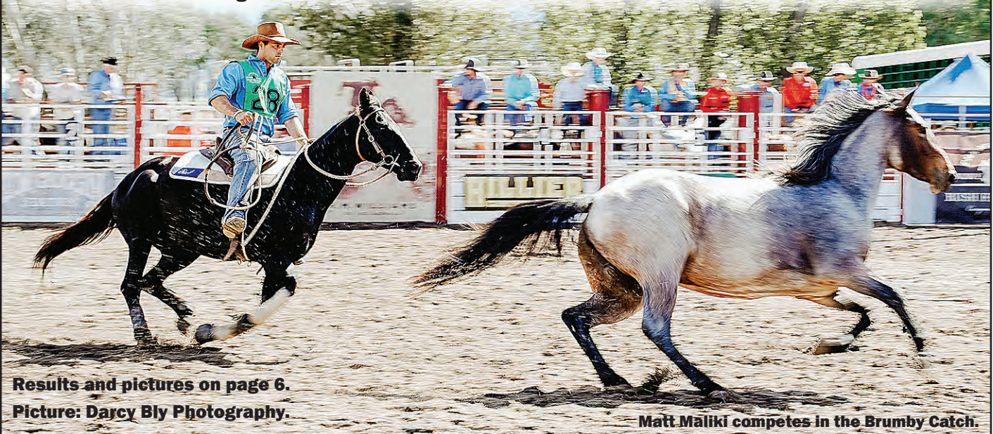
Results and pictures on page 6.

It was estimated that 20,000 people came through the gate over the festival with the only casualty being the re-enactment at Thougla which was cancelled because of the wet conditions.