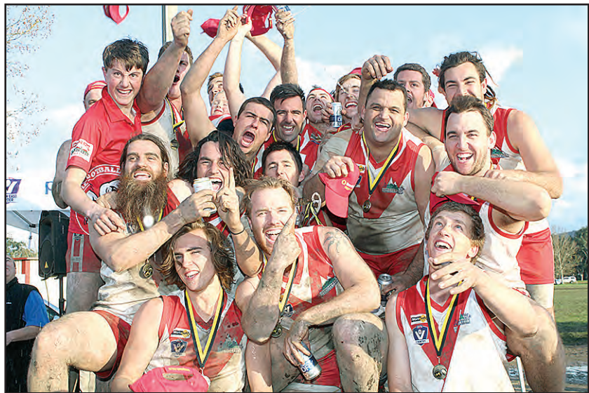
Federals last won a senior flag in 2016.

The junior competition has been an issue for the league for a number of years and dwindling numbers and lack of a pathway for player development have decimated the ranks, with many young players seeking opportunities in other leagues.