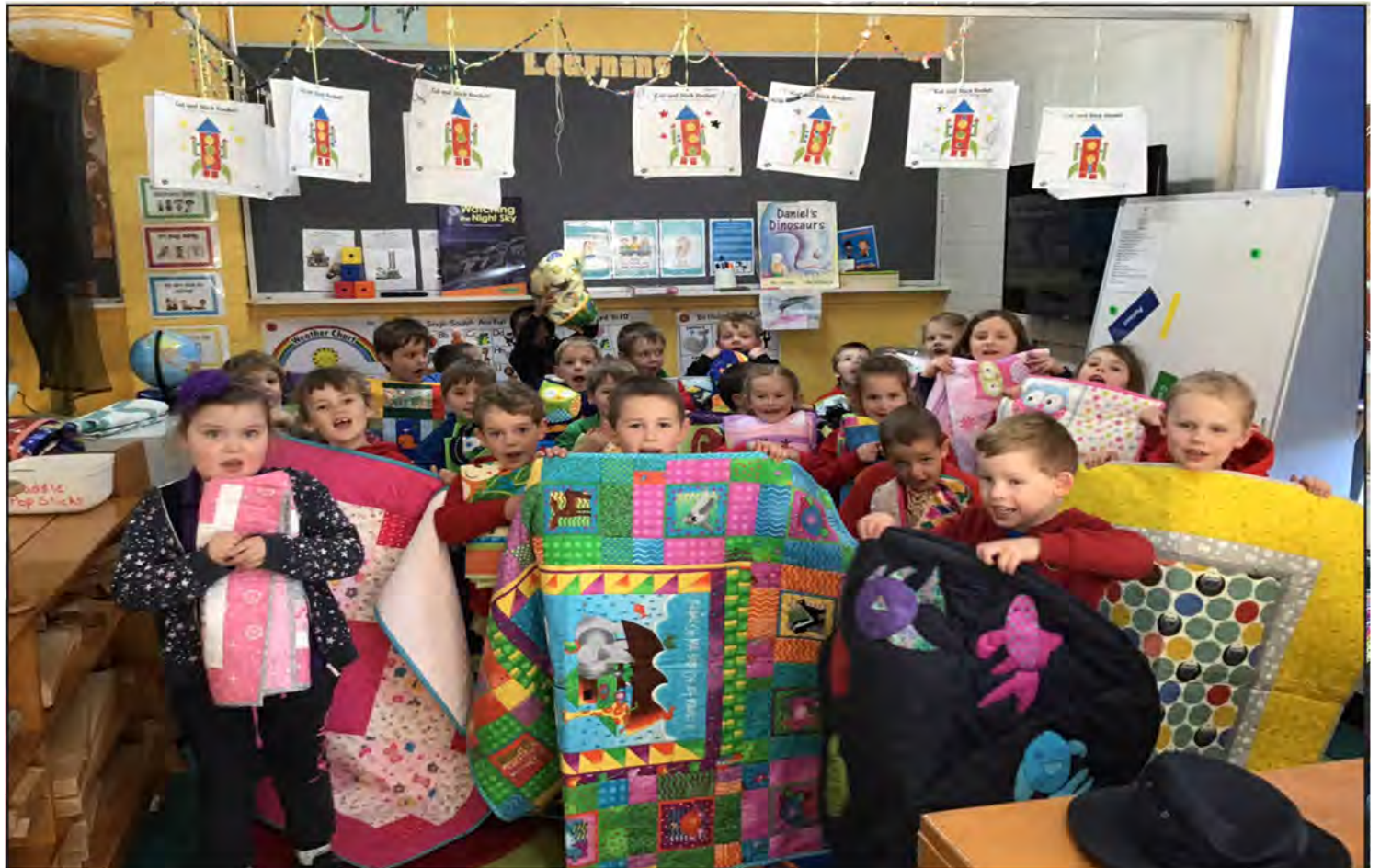
MADE WITH LOVE: Children from Corryong Kindergarten were among the first to receive one of 492 handmade quilts donated from across Australia by Oz Comfort Quilts.

For those without internet access, call the Recovery Hub and we can help.