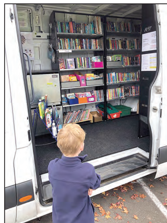
Luke Taprell waits to check out the new range of books.

"The group has developed a cluster Writing Data Wall with photos of all of the students so they can be monitored and moved between levels as they reach writing milestones.