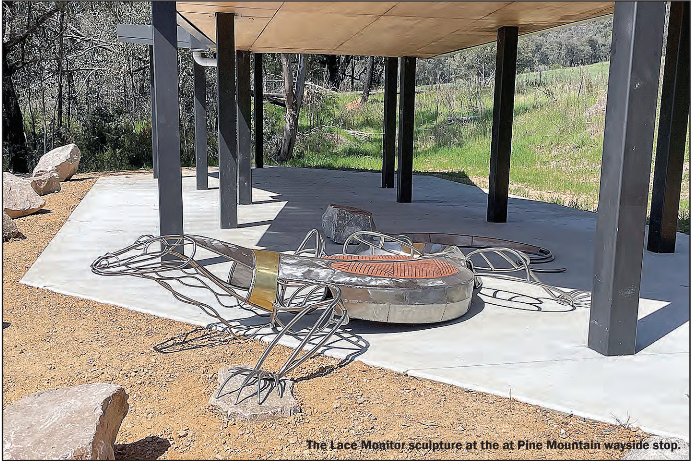
The Lace Monitor sculpture at the at Pine Mountain wayside stop.

Local fauna features in a series of public artworks as part of a local touring route in the region - The Great River Road - which starts at Bellbridge on the Hume Dam and wends it way along the mighty Murray River to Khancoban.