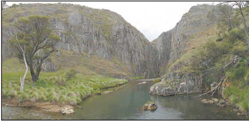
Blue Waterholes is a great base for exploring the park.

With such diverse areas, the park supports a potpourri of plant and animal life, including many alpine plants which are found nowhere else in