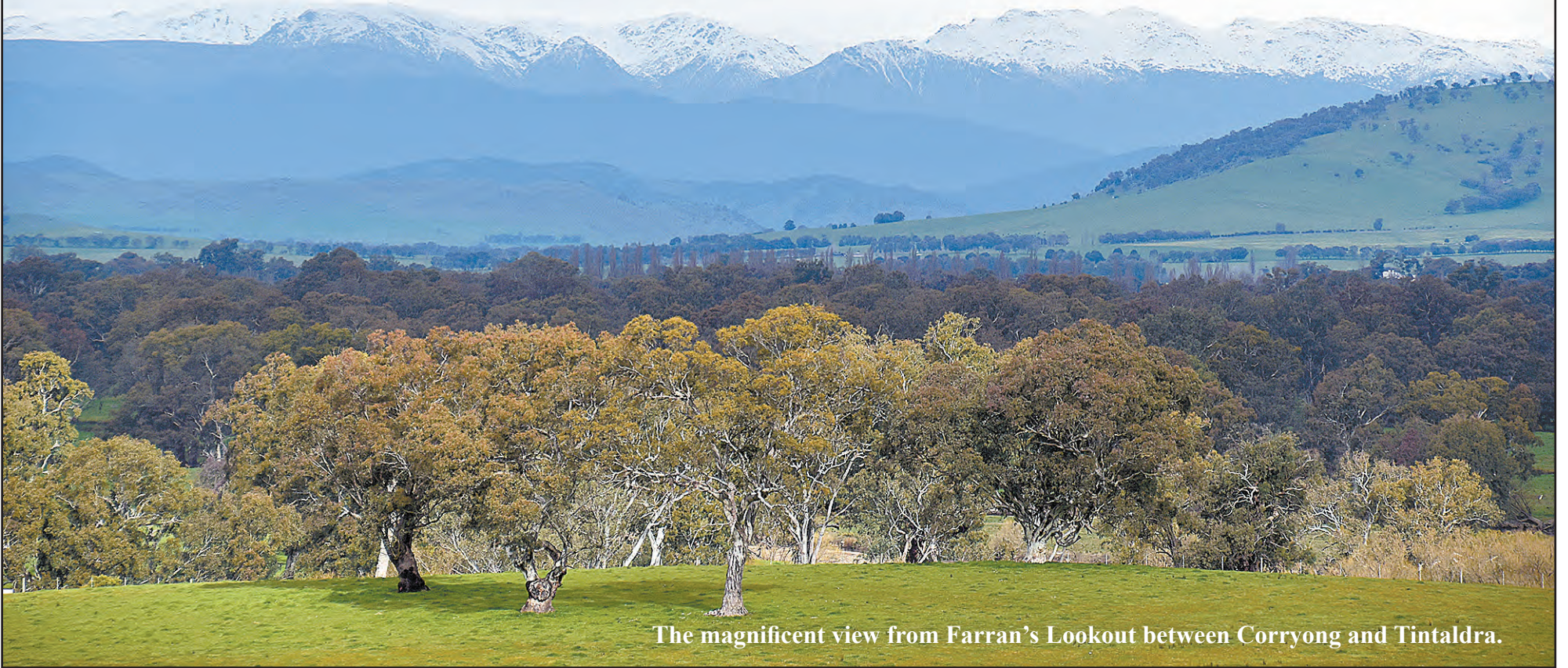
The magnificent view from Farran's Lookout between Corryong and Tintaldra.

Corryong is undoubtedly the jewelled centre piece of the magnificent region known as the Upper Murray. Located just 11kms from the Murray River and in the foothills of the Australian Alps, Corryong and district has something for everyone.